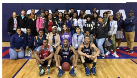
Upward Bound College Tour 2017 visiting Catwba College