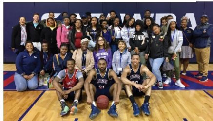
Upward Bound College Tour 2017 visiting Catwba College