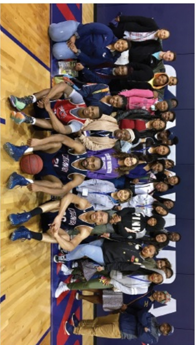
Upward Bound College Tour 2017 visiting Calamba College